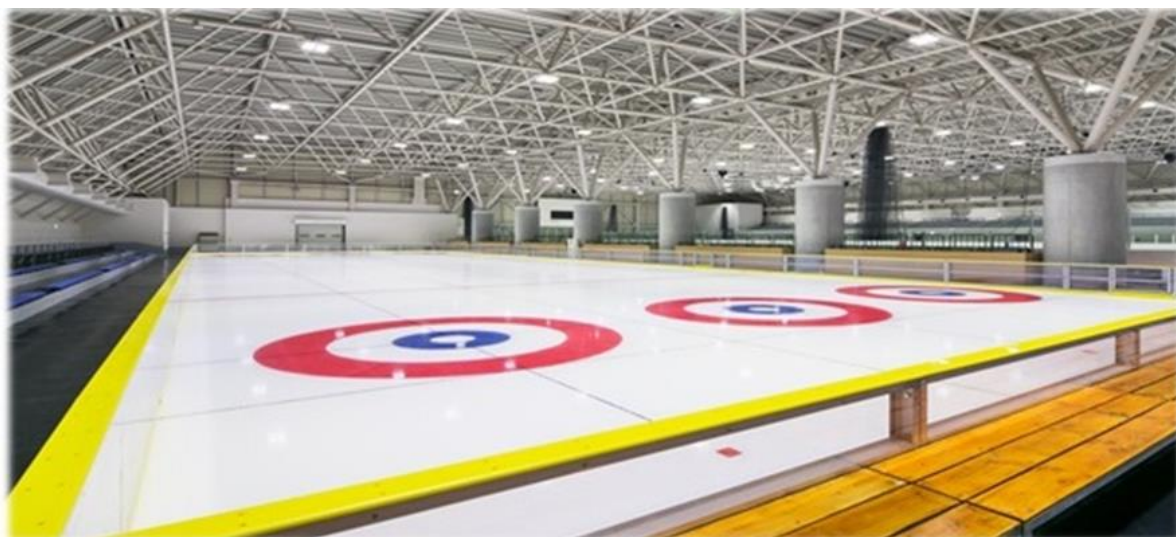
Host Rink: Niigata Asahi Alex Ice Arena Main rink (Olympic size ice hockey rink) and Sub rink (shown above)

Look forward to your entries and seeing you all at the new destination!